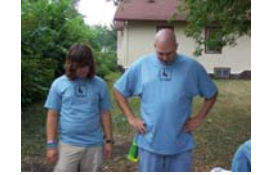
Prayer time was sweet