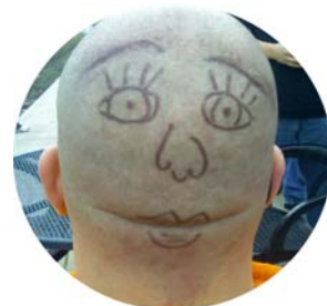
Some of my students' handiwork!

Most importantly, I am going to need lots of prayer for this trip. Prayer is really the key to successful ministry and this is no exception. Our team needs prayer to be united and to always be focusing on God, no matter what happens. As I will be in leadership on the team, I would also ask that you pray for patience and willingness to be flexible. I will also need prayer for me personally to stay looking to God and that God will be able to shine through me to show the people what Christ can do in us and in them.