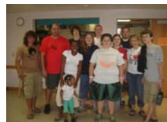
Checking out of UISR

We checked out for good from UISR center, then went to the Mall of America to share our witness with people there. We then drove to Devils Lake State Park in Wisconsin to meet our last helpers, Phantom Ranch, in preparation for Sunday morning.