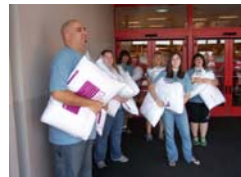
Getting pillows at Target

We served at Emma Norton Services, an agency that helps women in transition get back on their feet. We painted, cleaned, landscaped, and served a special treat (ice cream!) as well as bringing them some much needed gifts.