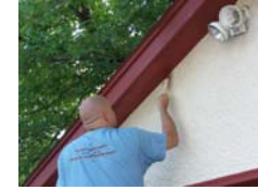
Me doing touch-up