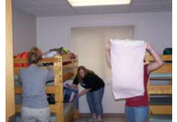
We settled into the dorm