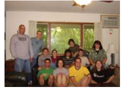
We stopped to see friends

We left Wisconsin and went to Minneapolis to start our Urban Immersion Service Retreat. We would be serving in the community with them until Wednesday morning.