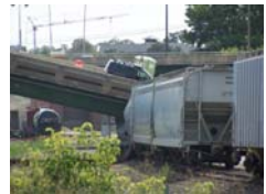
Minneapolis Bridge Collapse

We checked out of our service retreat and went to the bridge collapse to process that with the students. We then toured the EFCA headquarters and met the live 0 team. After checking back in to the center, we wrapped up the day with a mobile packing at Feed My Starving Children.