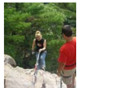
Watch that first step

After another camping in the rain experience, we started a beautiful day by rock climbing at the park. We loaded up and met our youth group (and my family!) at mini-golf before unloading and saying goodbye.