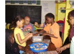
We worked with beads