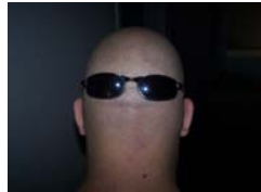
My better side

We served today at the Marie Sandvik Center, a Christian agency that helps the poor and homeless in the city. In the evening we visited a former youth group staff member in Central Minnesota (a surprise for almost everyone)