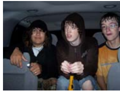
Soaked guys after tents are up

We stayed in the rain at Yogi's Jellystone Campground in Wisconsin Dells. Our tents went up in the rain, and we got soaked, but it was an experience we could talk about all trip long!