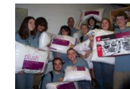
We brought stuff for them