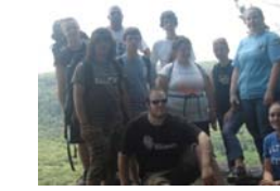
Team on the Rock